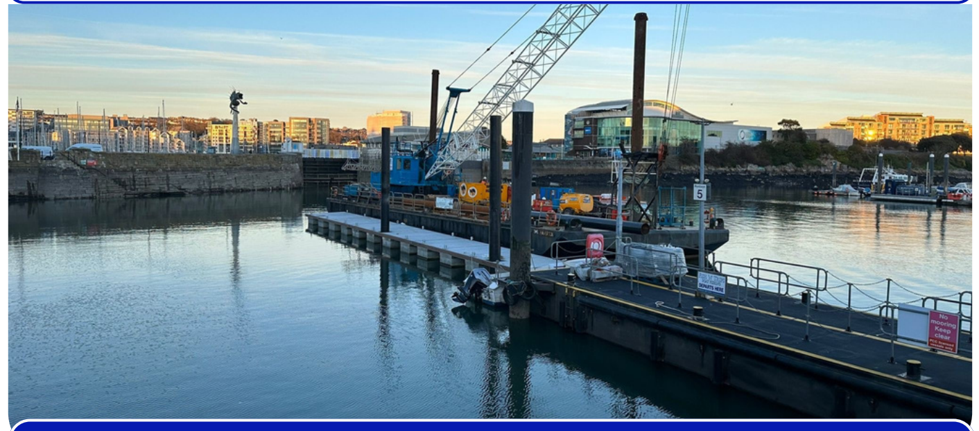
Client: Cattewater Harbour Commissioners